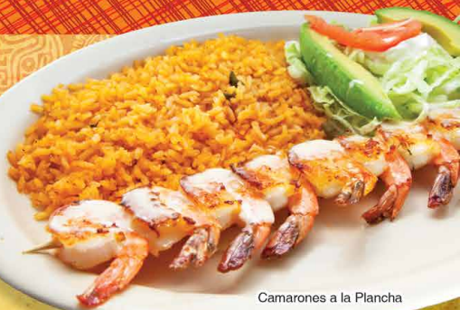
Camarones a la Plancha