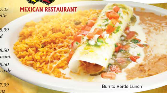
Burrito Verde Lunch