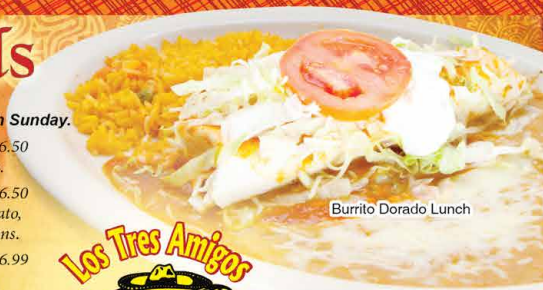
Burrito Dorado Lunch

Burrito Verde Lunch ..... 6.99 Choice of one burrito chicken or beef tips topped with cheese sauce, tomatillo sauce & pico de gallo. Served with rice & beans.